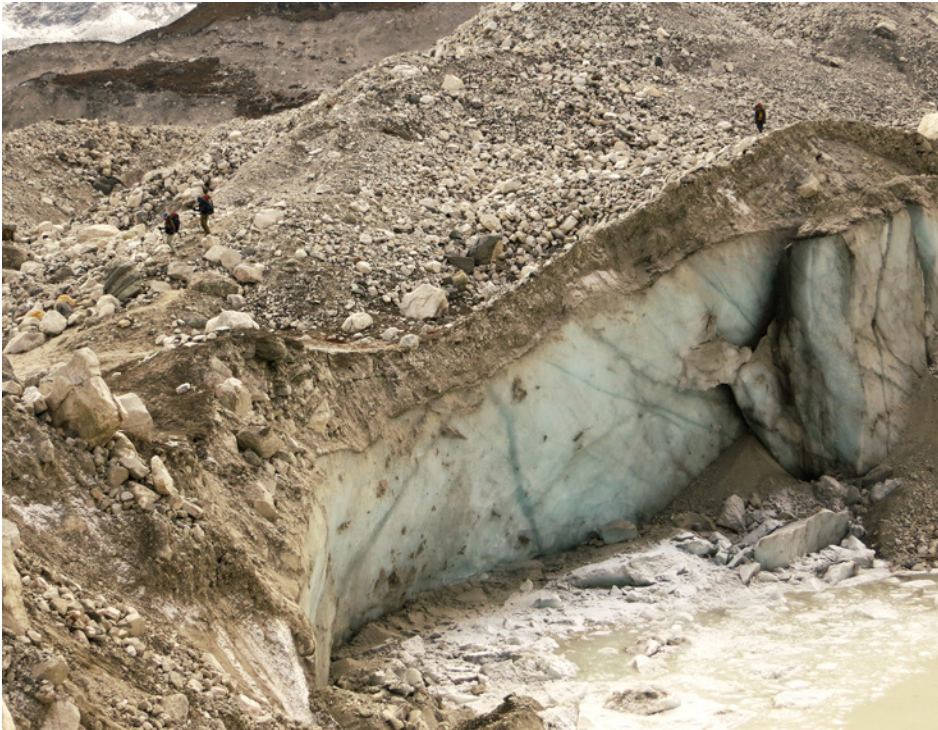
Figure 2. This debris-covered glacier in Nepal is an example of how colossal deposits of ice may be entirely covered by a thick layer of rock, protecting it from the warmer environment above. Note the size of the trekkers for proportion.

The fight to protect these glaciers took on monumental proportions and spilled into communities up and down the Andes on both sides of the border. The very names of the glaciers took on new meaning for this cryoactivist movement.